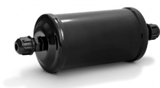
Dry filter MY 2018