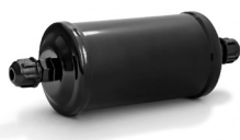
Dry filter MPP/HPP Line