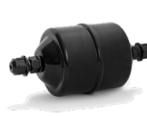
Dry filter LPP Line